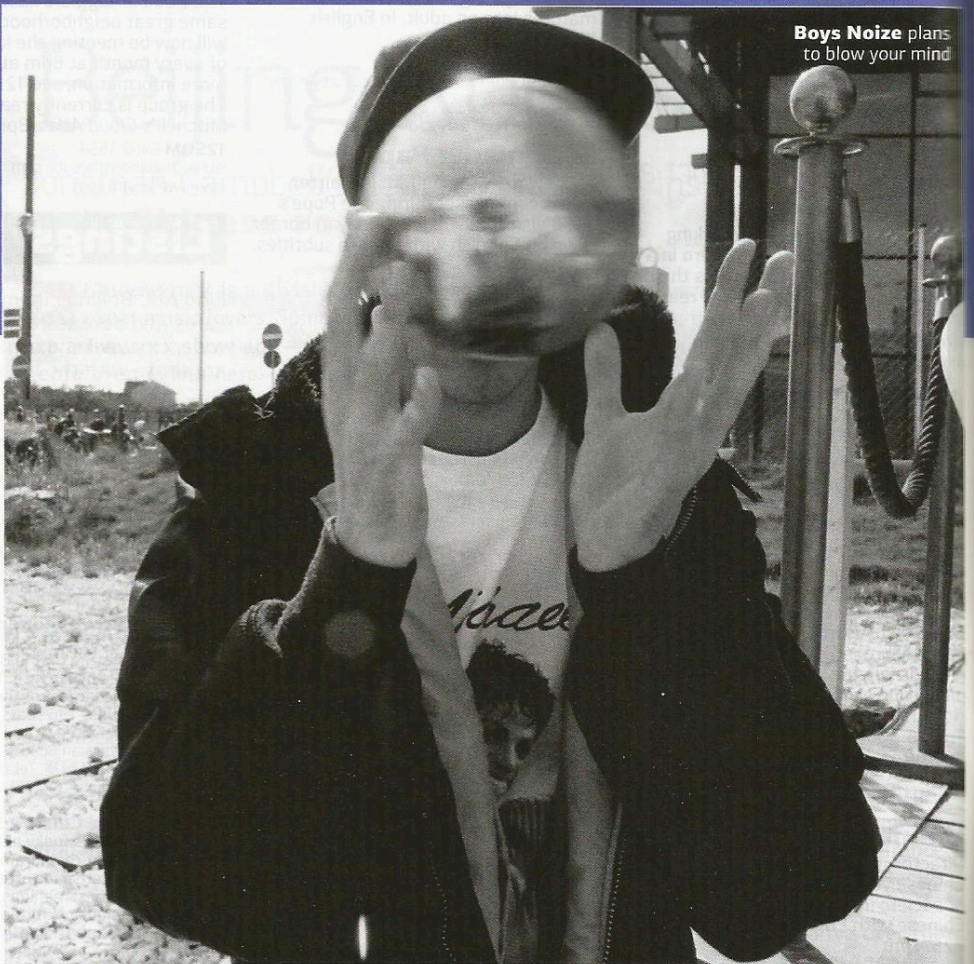
Boys Noize plans to blow your mind