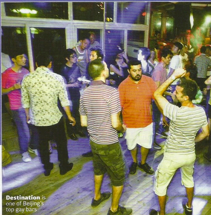
Destination is one of Beijing's top gay bars

Just when you thought it was over, Jing Pride continues at Tun Bar on Saturday, July 30 at 10pm. The ¥50 entry fee will be donated to the LGBT Center to promote awareness. Find it: Sanlitun South St, 4 Gongti Beilu, Tel: 138-1040-1995